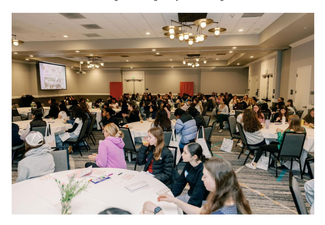
The event was sold out, and welcomed students from every high school in the County.