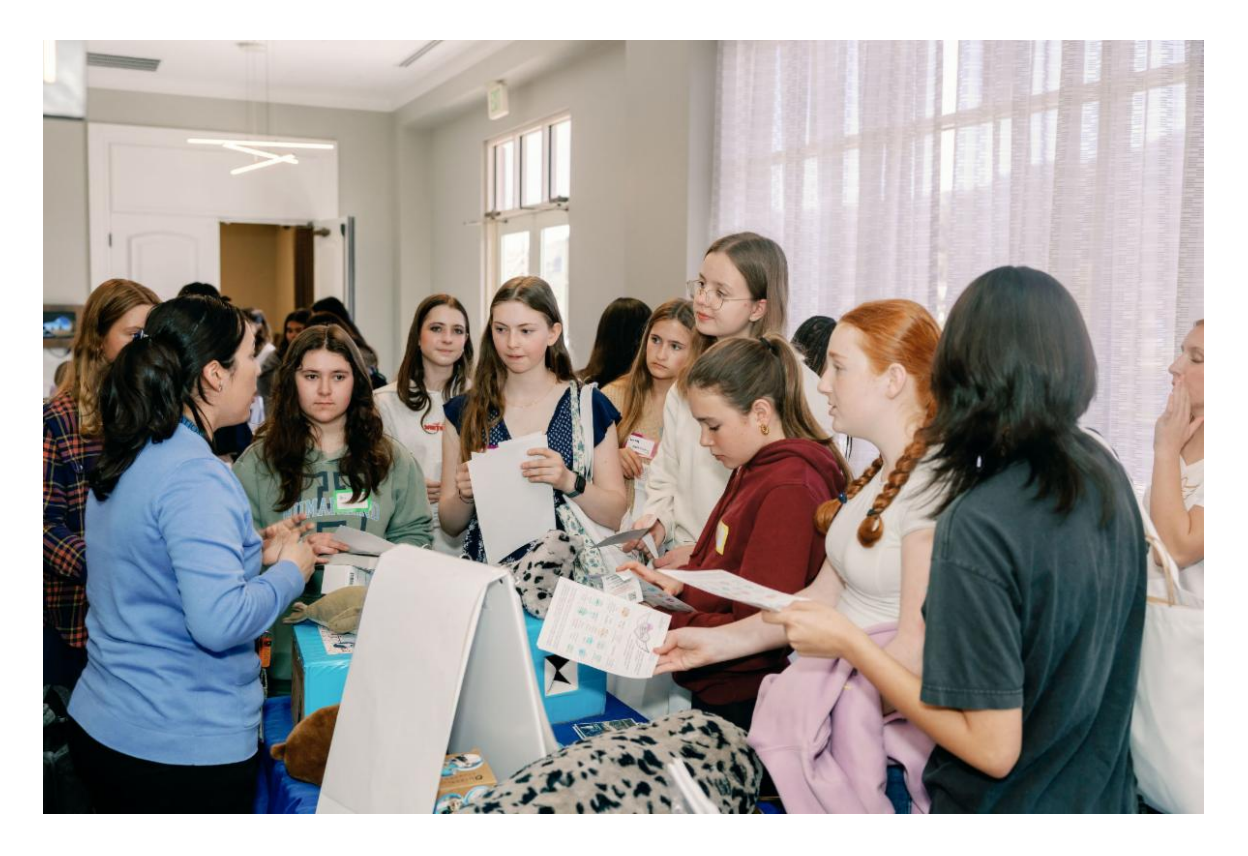
Exhibitor Hall featured 18 interesting and thoughtfully curated organizations.